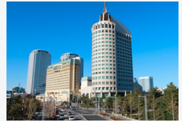
Hotel The Manhattan Tokyo or equivalent

Upgrade to Superior Room in Osaka & Tokyo: US$149/person