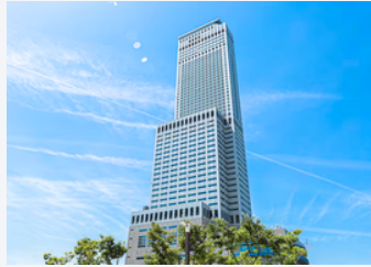
Odysis Suite Osaka Airport Hotel or equivalent