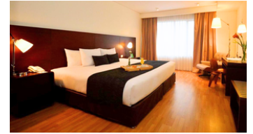
Dazzler by Wyndham Lima Miraflores or equivalent