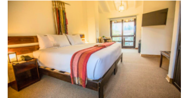
Tierra Viva Valle Sacred Valley or equivalent